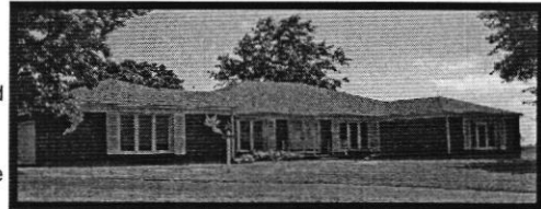
OPEN HOUSE: SATURDAY, JULY 20, 1-4PM

HOUSE redwood trim, 4 bedrooms, 2 3/4 baths, living room, family room with wood burning fireplace with gas lighter, formal dining room, large eat in kitchen, laundry room, double entry door foyer, a full basement with wood burning fireplace with gas lighter. Home is located on Highway C just inside Slater city limits and is zoned agricultural/industrial. Home was built in 1971. Roof replaced in June 2017, furnace and air conditioner replaced in January 2018. Electrical service panel replaced in 2015. Vinyl windows with aluminum moldings replaced around 2009. Glass/screened porch replaced in 2008. Kitchen updated in 1991. Property has been broker evaluated and appraised. Termite inspected. Title insurance furnished. This beautiful home is in a good location and ready for occupancy. The sellers are highly motivated, but reserves the right to reject any and/or all bids. To inspect property contact Stephen Jaeger 660-529-3672 , stephenlj1957@att.net , Ronald McCoy 660-631-4518 or John Brownfield 660-631-5949